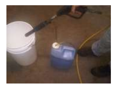
Step 2. Set your equipment to disinfect and using normal pressure spray into the plastic garbage pail, and fill to the 20 L mark.

Step 3. Once the pail has been filled to the 20L mark, measure the amount of water in the disinfectant reservoir. Write this figure down. (B)